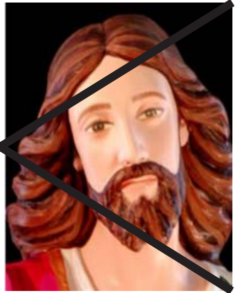
A STRIKING resemblance: The bust is that of ZEUS, the statue is that of the Christian JESUS. We cannot condone intermixing Scripture and pagan traditions.