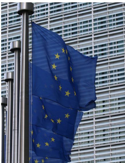
Flag of the European Union

ties of a teaching priesthood to all nations of the world. Their minds and attitudes were to be totally different from the nations around them (a converted attitude). As they lived a righteous life, they would receive blessings for keeping Yahweh's commandments, rather than to be cursed for disobedience as are the worldly nations.